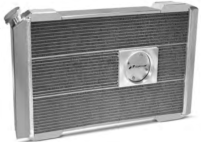
LS Conversion Systems